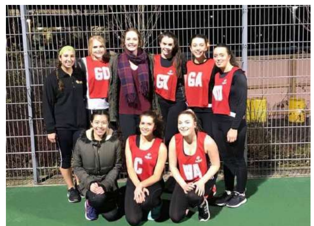
Inter-college Netball Tournament