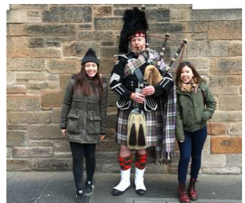
Day trip to Edinburgh