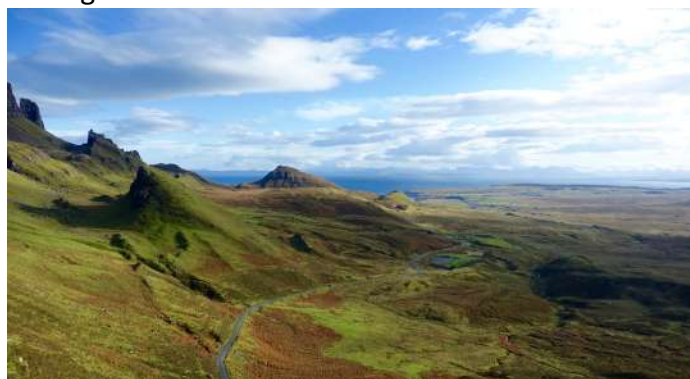
Stunning natural landscape in Highland