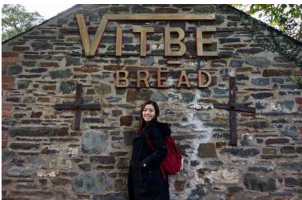
Solo trip to Cardiff

As I have joined the college netball team, I joined the inter-college tournament and competed against other college every Tuesday night. It was rainy and windy for the whole November so playing game at outdoor court at below 5 degree Celsius was quite challenging and unforgettable. Moreover I have made friends from Hong Kong via social gathering. My friend and I visited Edinburgh Christmas market. It was definitely the best Christmas market-to-go and I love the mulled wine very much. Also, I have been to Birmingham during the Black Friday weekend to enjoy the great discount. It is a shopper paradise with almost all department stores in walking distance to the train station. The Christmas market in Birmingham should be the largest in the UK as it covered half of the city center.