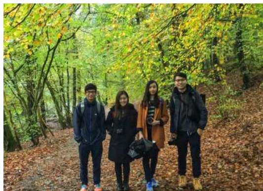
Explore Lake District

The Michaelmas term commenced on 9 th October. I have enrolled in two accounting courses and one philosophy course. Similar to the tutorial session in HKUST, I had tutorial for each course. By this moment, the workload was fair as all midterms and assignments would start after week 5, except attendance was taken and weekly assignment was collected in every tutorial session. In total, I have 9 hours of class every week with a Friday off so I have plenty of time to explore the UK. I have been to Manchester, Lake District, Edinburgh and Highland during the weekends.