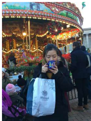
Shopping and Tasting mulled wine in Birmingham during Black Friday weekend