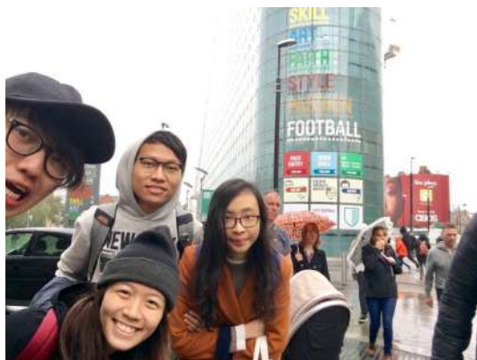
Flash trip to Manchester

It was strange to be a freshman again but I was lucky to be surrounded by friends from HKUST and my college. Via iLancaster, my HKUST friends and I joined a wide range of orientation activities such as International student orientation talk, free traditional high tea and college breakfast date etc. I have made friends from literally all over the world, including the Mainland, USA, Australia and Qatar and so on. Moreover, I have joined one of the college netball team as well. My team mates are mainly local and we practiced twice a week. The social secretary of the college teams organized social events every two weeks. I was so fortunate to be part of them as they made me feel like being home.